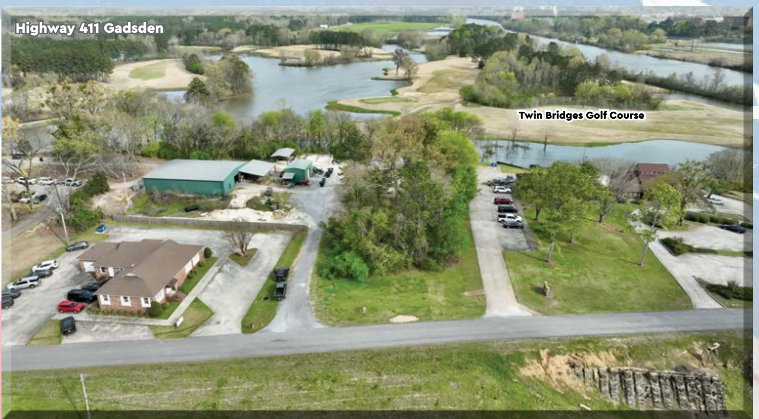
Twin Bridges Golf Course